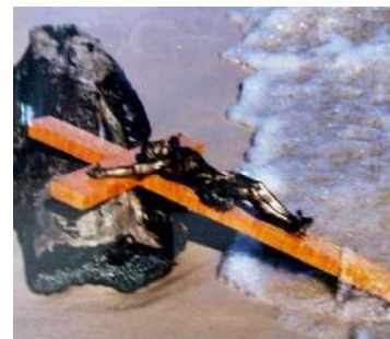
The crucifix brought to America with the first missionary brothers.