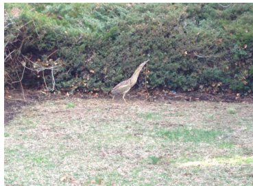
A rare sight just outside the cafeteria.